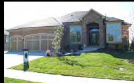
#51 • C & M Builders 1208 Metfield Lane • Creekmoor Raymore, MO • $399,850