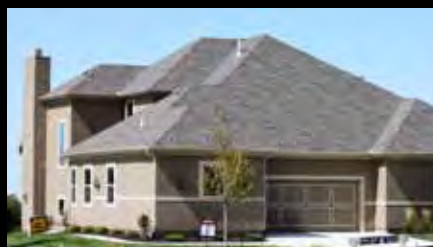
#172 • James Engle Custom Homes 24521 W 110 th St • Prairie Brook Villas Olathe, KS • $278,418