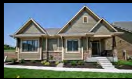
#130 • Tom French Construction 8530 Barstow St • Cross Point Creek Lenexa, KS • $371,325