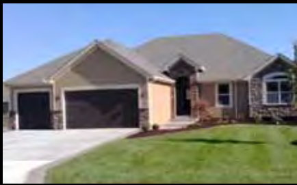
#25 • McBee Custom Homes 804 SW Elizabeth • Indigo Hills Blue Springs, MO • $365,000