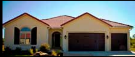
#41 • SAB Construction 2817 SW Corinth • Siena at Longview Lee's Summit, MO • $275,000