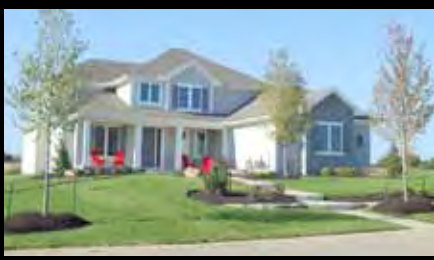
#110 • Starr Homes 11405 W 153 rd St • Bluestem Overland Park, KS • $523,800