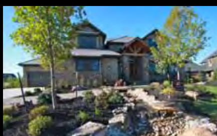
#148 • Starr Homes 11515 W 159 th Terr • Mills Farms Overland Park, KS • $989,400