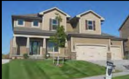
#52 • Summit Custom Homes 1208 Brunswick Lane • Creekmoor Raymore, MO • $325,000