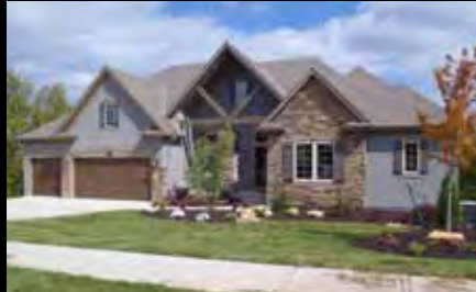
#54 • Pfeifer Homes 213 SW Morton Dr • Winterset Valley Lee's Summit, MO • $541,735