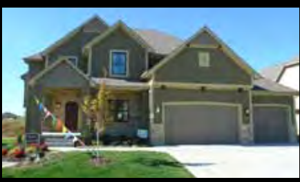
#66 • Homes By Chris 9504 NE 90 th St • Copperleaf Kansas City, MO • $424,900