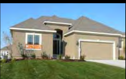
#142 • Moffitt Development Co 12819 W 49 th Terr • Heatherglen Shawnee, KS • $329,500