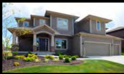
#111 • J S Robinson Fine Homes 21029 W 113 th Place • Brighton's Landing Olathe, KS • $369,950