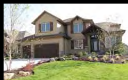
#155 • C & M Builders 16509 Lucille St • Meadows at Mills Farm Overland Park, KS • $484,950