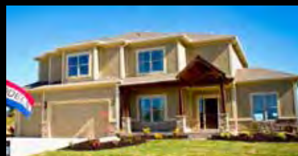
#55 • SAB Construction 3012 SW Muir Dr • Winterset Valley Lee's Summit, MO • $379,900