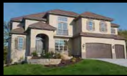
#120 • Don Julian Builders 9705 Hollis Lane • Canyon Creek by the Park Lenexa, KS • $444,900