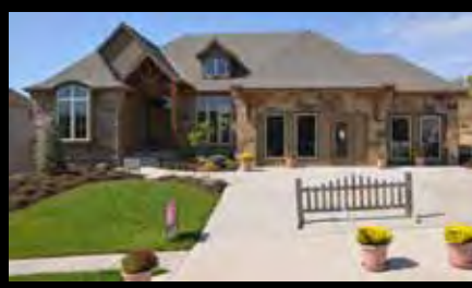
#67 • John Shilt Homes 9518 NE 90 th St • Copperleaf Kansas City, MO • $484,300