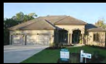
#80 • Don Julian Builders 6112 Arbor Way • Riss Lake Parkville, MO • $599,900