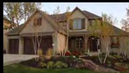
#197 • Bodine Ashner Builders 9427 W 157 th Court • Wilshire Farms Overland Park, KS • $642,900