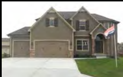
#37 • Summit Custom Homes 1404 SW 41 st Circle • Parkwood at Stoney Creek Lee's Summit, MO • $249,950