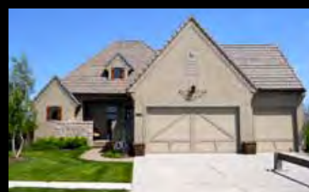
#159 • Don Julian Builders 15141 Buena Vista • Mission Reserve Leawood, KS • $799,900